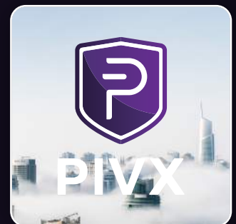
Logo on Busy Background